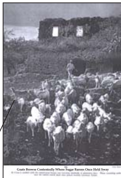
National Geographic, February 1956, Page 216

Do you need a useful gift to provide to your breeding stock buyers? This is a gift to hand to buyers or to mail to them prior to lambing to remind them of your flock. The farm flock books have a space on the inside cover to put your contact information. We suggest that you print a small label or have one printed that you can paste into the book. To make handling and shipping efficient, they will be available at $5 for four books. Send your request to Barbara Pugh, 5332 N. C. 87 North, Pittsboro, NC 27312. Payment made to KHSI should be included.