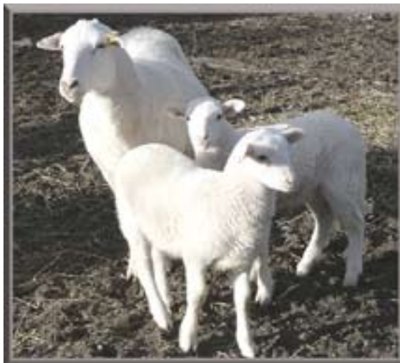
"Julie & Twins"

Photography by Joyce Geiler, Pocahantas, IL 2005 KHSI Photo Contest First Place - Best Promotion