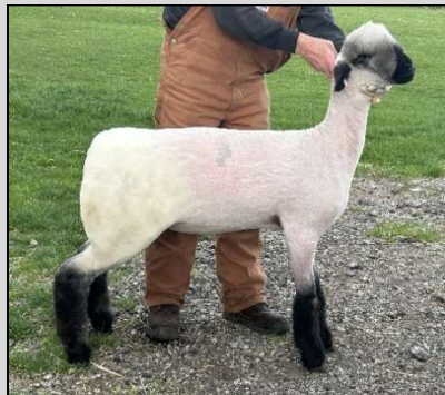
Apple 24-13, January Ewe Lamb from the 2024 Indiana Premier Sale, which sold to Kentucky for $1,300 (high selling Oxford).